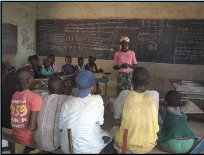
A Children's Club Meeting.

We have already stated that illiteracy is like living in the dark. As illiterates;