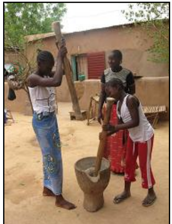
We help our mothers.